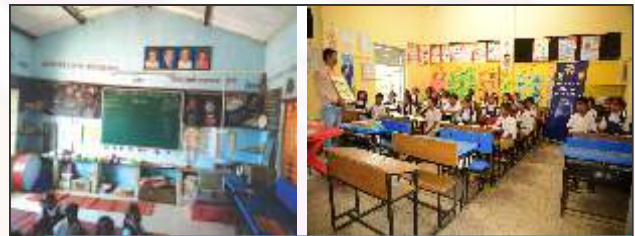
Before & After images of a classroom of Patipada ZP School, transformation by IWC Bombay Queens Necklace, IWD 314

IWC Bombay Queens Necklace, IWD 314 converted 3 government schools, Patipada Zilla Parishad School, Nagarmodi Zilla Parishad School and Shilte Zilla Parishad School into Happy School. The club painted the school building, renovated existing toilets and made them functional for the students; hand washing stations were also installed in the schools. The club also provided furniture for the staff room, school shoes and school bags and play materials to the school. The project is benefitting more than 150 students and 10 teachers.