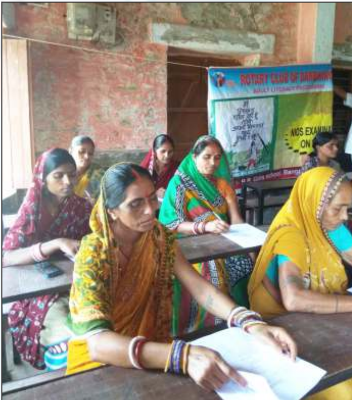
RC Darbhanga conducts NIOS Examination