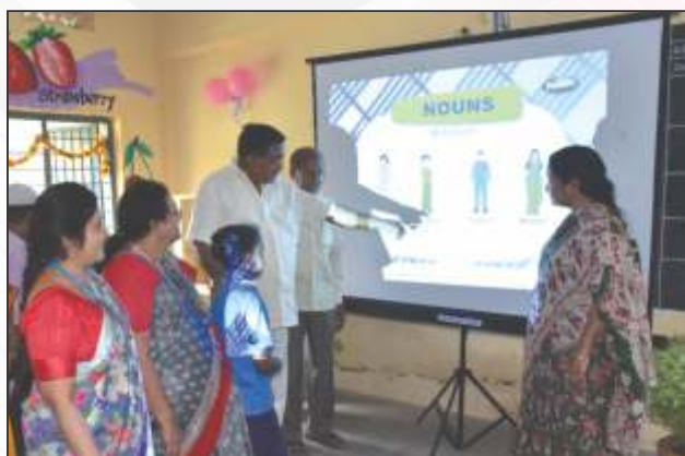
E-learning facility installed at a government school by IWC Vijaywada, IWD 302

IWC Vijaywada, IWD 302 installed E-learning facility in Regula Anuradha Municipal Corporation Elementary School of Vijaywada to make teaching and learning experience more interesting for both the students and teachers. The club provided projector of BenQ with UPS, Monitor, CPU, Keyboard, Mouse, Screen and Speakers. The project is benefitting 148 students.