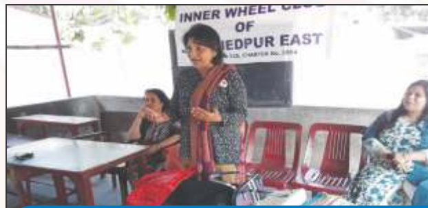
Teacher Training conducted by IWC Jamshedpur, IWD 325

A teacher training workshop was conducted by IWC Mangalore North, IWD 318 where one teacher from each of the 50 government and government-aided schools had participated. The five day training focused on the concept of Nali Kali based on audio-visual aids which will help to improve the overall skills of the children to learn subjects. Nalikali was first developed in 1995 by teachers in Karnataka's Mysore district, the Nali Kali strategy adopted creative learning practices to help retain children in school and bring in those not attending school.