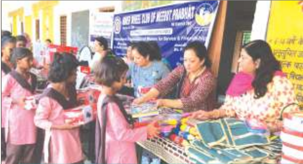
Distribution of School shoes & bags by IWC Meerut Prabhat, IWD 308

paint for the school building and roof, renovated old toilets and made them functional, installed hand washing station, installed clean and drinking water facility, constructed library with new books and also provided sports material for the students. 125 students are benefitting from this project.