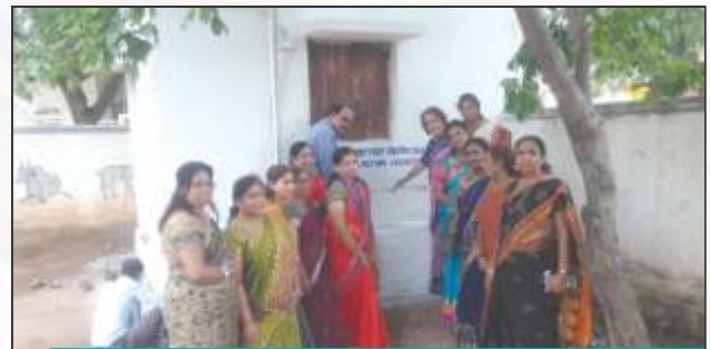
Hand Washing station installed at Govt. Higher Primary School by IWC Gadag-Betgeri, IWD 318

IWC Vijaywada, IWD 302 converted Mandal Parishad Primary School and MPP School government school of Vijaywada into Happy School. The club provided paint for the school building, benches and desks for the students, books for library, sports material and school bags for the library. The club also equipped the school with clean drinking water facility, constructed functional separate toilets for boys and girls & also renovated the existing toilets. 100 students are benefitting from this project.