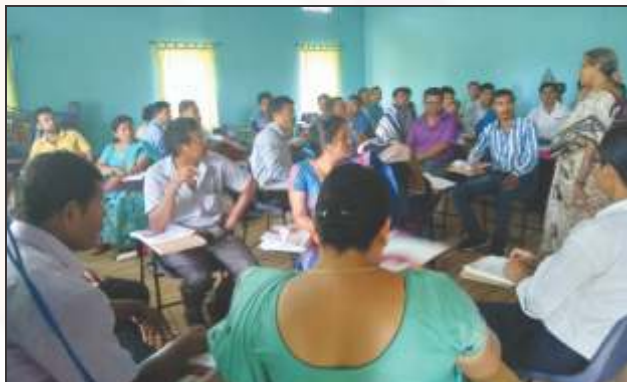
Teacher Training conducted by RC Golaghat, RID 3240

RC Golaghat, RID 3240 organized 2 day teacher training where teachers from 24 schools from in and around Golaghat area participated. 44 teachers were trained at this workshop. The training was conducted by Royal Society of Chemistry. The training was provided free of cost. It was an interactive session where the trainer made use of different examples to explain different activities. The teachers were given different task to be performed in different ways. This program will not only improve the professional skills of teachers but also make them confident.