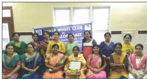
Teachers felicitated with NBA by IWC Mangalore East, IWD 318

IWC Mangalore East, IWD 318 felicitated 5 outstanding teachers with Nation Builder Award. A detailed evaluation process was carried out in 3 government schools of Mangalore, Government High School Moodshede, Mangalore Taluk, Government High School, Attavara and D.K. Zilla Panchayat Higher Primary School, Baikampady Mangalore. The students and principals of the schools participated in the evaluation process. 18 teachers were evaluated out of whom 5 outstanding teachers were honored with Nation Builder Award.