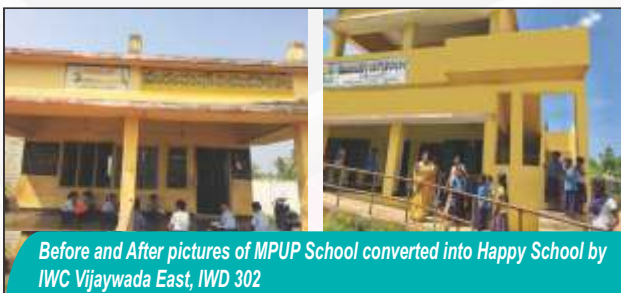
Before and After pictures of MPUP School converted into Happy School by IWC Vijaywada East, IWD 302

IWC Vijaywada East, IWD 302 transformed MPUP School located in Maddaikunta Nuzvid mandal, Vijaywada into Happy School. The club provided paint for the school building, repaired the windows and doors of the classrooms and equipped the school with clean drinking water facility for both the students and teachers. The club had also renovated the existing toilets for the students. Further to