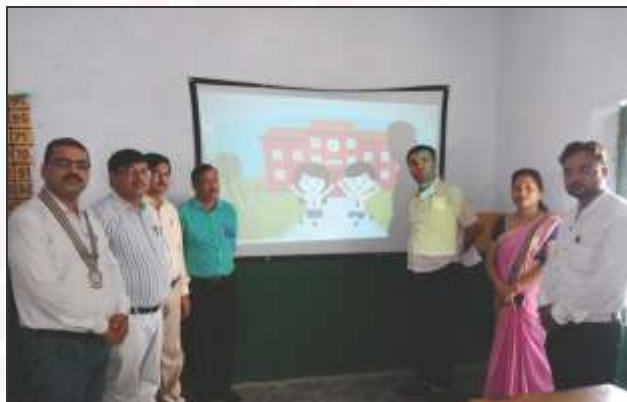
E-learning facility provided at a government school by RC Kanpur Vinayak Shree, RID 3110

RC Kanpur Vinayak Shree, RID 3110 installed E-learning facility in 2 government schools, Primary School Mazhra Piperkhera Ahetmali, Unnao and Primary School Kashiram Nagar Vikas Khand, Kalayanpur located in Kanpur. 370 students are benefitting from this project as reported by the club.