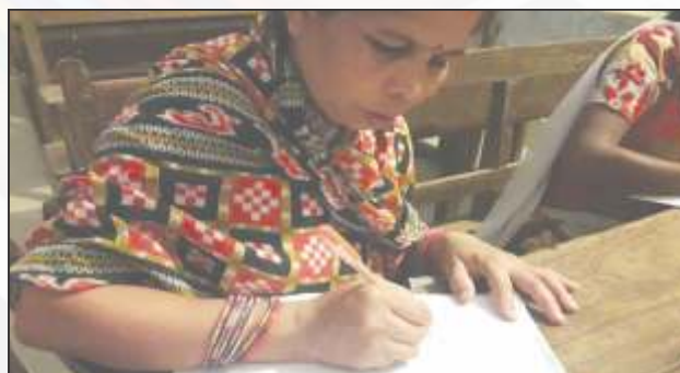
Adult learner writing exam held by IWC Berhampur, IWD 326

IWC Berhampur, IWD 326 conducted exams for 53 adult non-literates after training them for three months at an Adult Literacy Center.