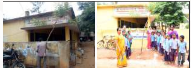
Before and After pictures of Mandal Parishad School converted into Happy School by IWC Vijaywada, IWD 302

this, benches and desks for the students, books for library, school shoes were also provided. Sports materials were also donated by the club members for the school students. 150 students and 11 teachers are benefitting from this project.