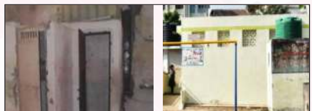
Before and after pictures of toilets of Kalol Primary Sc M. E. school by RC Kalol, RID 3054 after

IWC Gadag- Betgeri, IWD 317 transformed Government Higher Primary School No. 16 of Vivekananda Nagar, Gadag into Happy school by providing paint for the school building to make it more attractive place for learning. New and separate toilets were constructed by the clubs. The club also equipped the school with clean drinking water facility and also installed hand washing station. Books for libraries and play materials were provided by the clubs. 78 students are benefitting from this project.