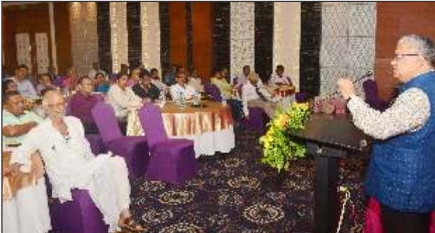
Level - III training session at Bhubaneswar, RID 3262

During the month of November, RID 3262 organized Level III literacy seminar at Bhubaneswar. PRID Shekhar Mehta and PDG Anirudha Roy Chowdhury had graced the event. Each vertical of the T-E-A-C-H program were discussed elaborately. DG Bhabani Chowdhury and DLCC PDG Sibabrata Dash assured to take up T-E-A-C-H as the flagship program of the district.