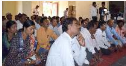
Teachers of Washim receiving training on the usage of E-learning system

Washim being the most backward district of the state, the identification of schools was a tough work. Equipping these schools with digital learning system would help students as well as the teachers and also schools to increase their enrollment to a great extent. Rotary Club of Navi Mumbai Industrial Area, Rotary Club of Bombay and RID 3030 had extended their support for digitizing these remaining 86 schools in Washim.