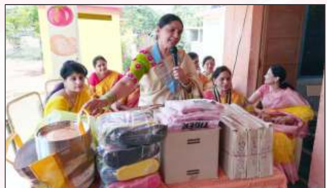
School shoes and bags donated by IWC Guntur, IWD 315

RC Warangal Aahladita, IWD 315 adopted Govt primary school, located in Thota and provided hand washing station, constructed library with new books and also provided sports material for the students to sharpen their co-curricular skills. 101 students and 7 teachers are benefitting from this project.