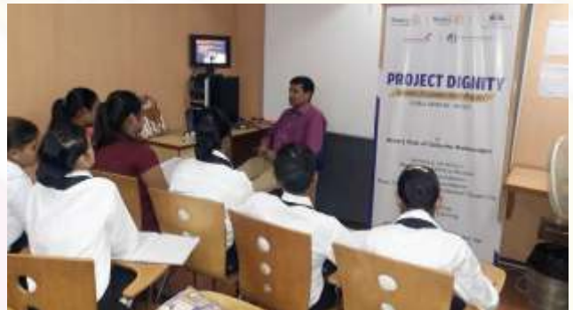
Students attending Hospitality Management training in WB organised by Emporium

THE LOOMBA FOUNDATION Caring for widows around the world