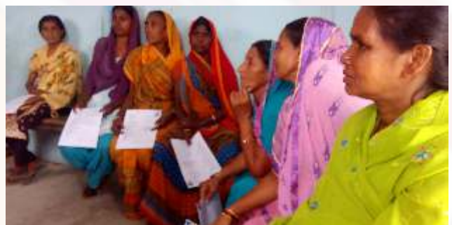
Screening of beneficiaries in Bihar by training partner Lok Bharti and RILM