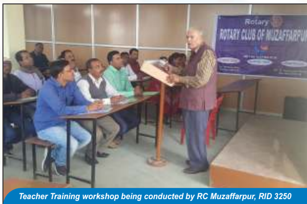
Teacher Training workshop being conducted by RC Muzaffarpur, RID 3250

RC Golaghat, RID 3240 organized teacher training workshop for government and government-aided school teachers for 2 days. First day of the training emphasized on Teacher Blooms Taxonomy, Personality Identifications & Pediatric Psychology and its handling pedagogy. The second day focused on negotiation skills, leadership skills, stress management, conflict management and evaluation parameters of child and nurturing techniques. 55 teachers had participated in the training.