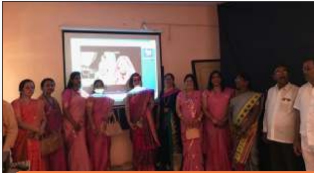
E-learning facility installed in a government school of Bagalkot, IWD 317

IWC of Tasgaon, IWD 317 donated an E-learning kit to a government school of Tasgaon to improve teaching and learning mythology of both teachers and students.