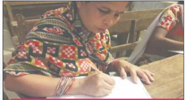
Adult learner writing exam held by IWC Berhampur, IWD 326

IWC Kolhapur Heritage, IWD 317 started an adult literacy center named as Vidya Mandir Kattyayani Karveer. The center is located at Karveer, Maharashtra. 30 adult learners are being trained there on basic reading and writing by a volunteer teacher from the community.