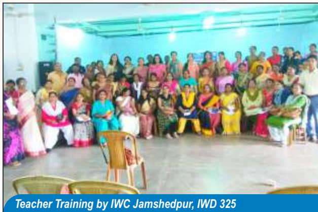
Teacher Training by IWC Jamshedpur, IWD 325

IWC Jamshedpur, IWD 325 organized a two day teacher training workshop. 58 teachers from 17 government schools of Jamshedpur had attended the training. The first day the training focused on child psychology and adolescent development, leadership and personal cognitive development and life skill education. The second day training emphasized on non-violence discipline, hygiene & sanitation development and enrichment of interpersonal skills. At the end of the second day all the participants were felicitated with certificates.