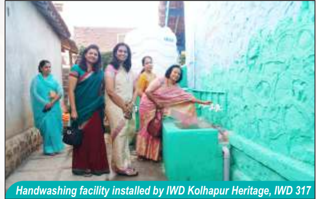
Handwashing facility installed by IWD Kolhapur Heritage, IWD 317

IWC Kolhapur Heritage, IWD 317 transformed Vidya Mandir Vaddawadi located in Vaddwadi, Kolhapur into Happy School. The club provided paint for the school building, repaired the windows and doors of the classrooms and equipped the school with clean drinking water facility for both the students and teachers. The club had also renovated the existing toilet and constructed a new toilet for the students. Sports materials were also provided by the club members for the school students. 120 students and 3 teachers are benefitting from this project.