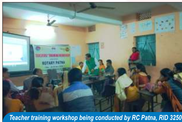
Teacher training workshop being conducted by RC Patna, RID 3250

RC Patna, RID 3250 organized a two day teacher training where 34 teachers from 20 government and government-schools had participated. The two day training focused on skill development of teachers through micro teaching aids, basics of teaching through power point presentation, time management during teaching, technique of evaluation. Apart from the aforementioned skills, the teachers were also briefed on rewarding technique, appreciation and punishment, home assignment and method of teaching and learning through story telling.