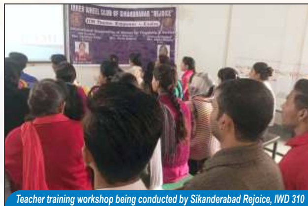
Teacher training workshop being conducted by Sikanderabad Rejoice, IWD 310

IWC Belgaum, IWD 317 organized a teacher training workshop where 24 teachers from government rural schools around Belagavi participated. The attendees were given special training on various subjects such as Chemistry, English Language, Social Studies, Mathematics and Computer Science.