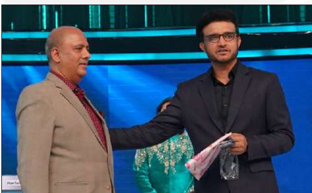
Dadagiri Season 10